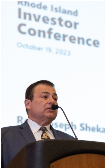
Rhode Island Speaker of the House of Representatives K. Joseph Shekarchi addressing the nearly 200 attendees at Rhode Island's inaugural Investor Conference, hosted by Treasurer Diossa in October 2023.

The Employees' Retirement System of Rhode Island (ERSRI) investment portfolio includes $10.5 billion of State pension assets. These are managed by the Office of the General Treasurer's investment team under policies set by the State Investment Commission (SIC). Treasury's investment division is tasked with investing the State's assets, most notably the defined benefit plan, which is the primary source of retirement income for more than 60,000 active and retired teachers, first responders, and state and municipal employees.